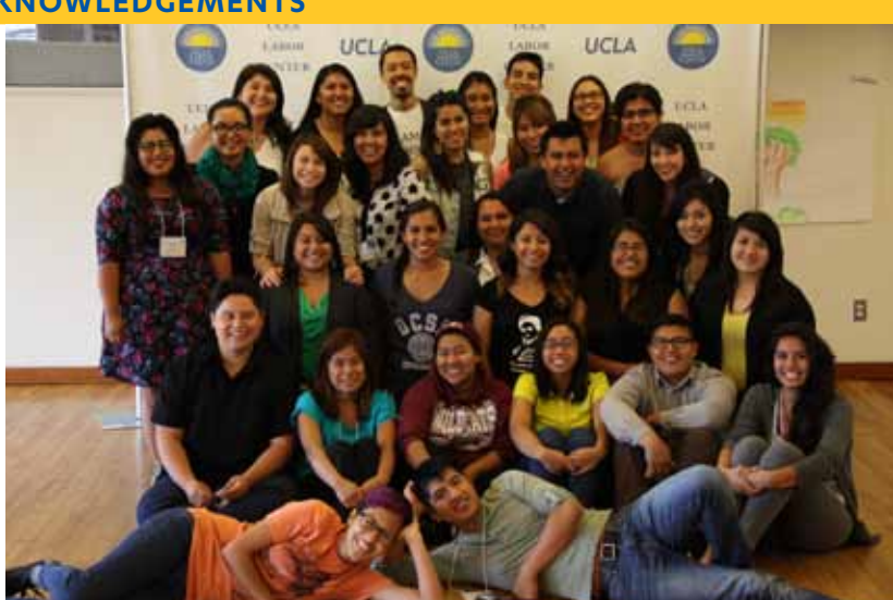
Healthy California 2014